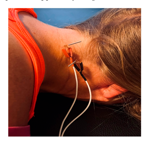
Figure 2. Dry needling with IEMS to posterior cervical muscles.

response (LTR). A LTR is characterized by a contraction of part of the taut band when needling a sensitive area within a TrP and is often used clinically to confirm the needle has reached a trigger point [58,59]. Since deeper muscles in the posterior cervical region are inaccessible to palpation, the LTR will be used as an objective sign of the TrP location. For the suboccipital muscles, only the obliquus capitis inferior will be needled as it is the only one that can be safely needled due to the proximity of the vertebral artery above the posterior arch of the atlas and the foramen magnum. With the patient in the prone position, the needle will be inserted inferiorly and laterally to the target TrP between the transverse process of C1 and the spinous process of C2, in the medial half of the muscle towards the posterior arch of C1 using a cranial-medial technique to direct the needle towards the patient's opposite eye (Figure 2) [60,61].