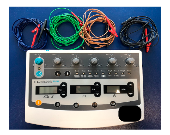
Figure 3. ITO ES-160 unit.