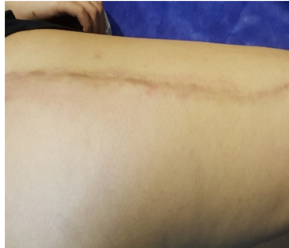
Fig. 1. The postoperative scar after right THA

Physical examination showed that both surgical areas